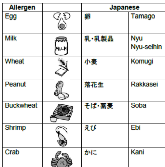
Top 7 Allergens Labeled in Japan

Remember, never be embarrassed if you feel you are not communicating effectively. If a member of the wait staff doesn't seem to understand your situation, always trust your instincts and seek out another staff member or manager. Sometimes, the safest choice is to avoid eating, and find a safe meal somewhere else.