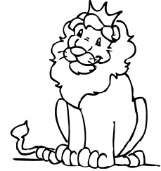
Lenny, the Lion is allergic to milk.

Unscramble these words related to Food Allergy Awareness Week!